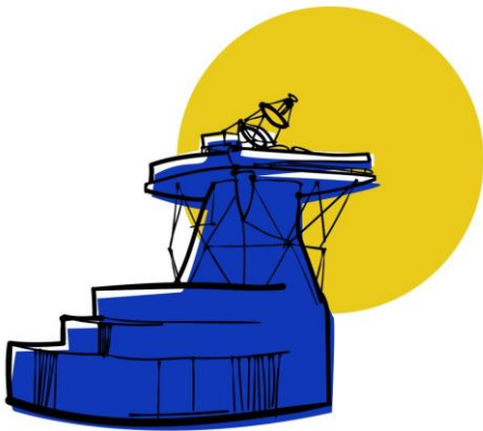
european solar telescope