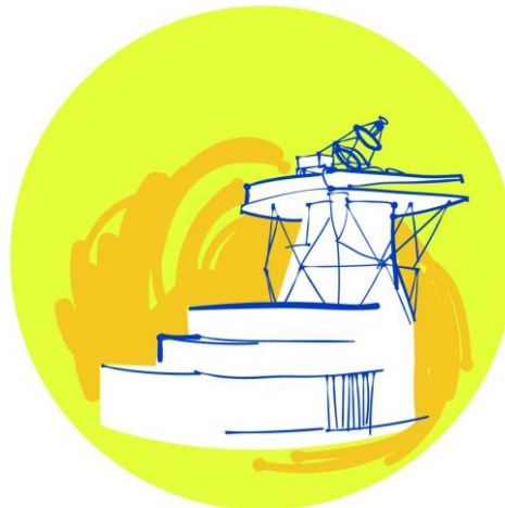
european solar telescope