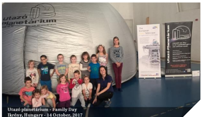
Utazó planetárium - Family Day Ikrény, Hungary - 14 October, 2017

In the past months, the EST Communication Office has been working in the new artistic design of the European Solar Telescope. These images use the colours of the EST logo and will be used in the design of some merchandising products that will be distributed in the coming weeks to promote EST within the solar physics community. Which one do you prefer? (see back cover page).