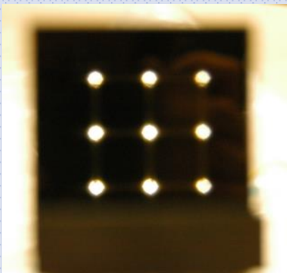
Front view of the double sided microlens array. The image shows a superposition of all the microlens array elements, viewed at different angles through the array.

The combination of a microscopic optical system and a macroscopic spectrograph requires the components of the MLA to be aligned with exceptional accuracy and stability. The manufactured array was executed on a single sheet of SiO 2 , and measures 128x128 elements, of which only ≈20 did not meet the < 1 μm alignment requirement between the optical elements on the front and the back side of the sheet. The high spectral resolution of >200000 that was achieved in tests at the Swedish Solar Telescope (SST) indicates that this technique allows us to achieve a spectral resolution that is high enough to measure atomic line profiles in detail.